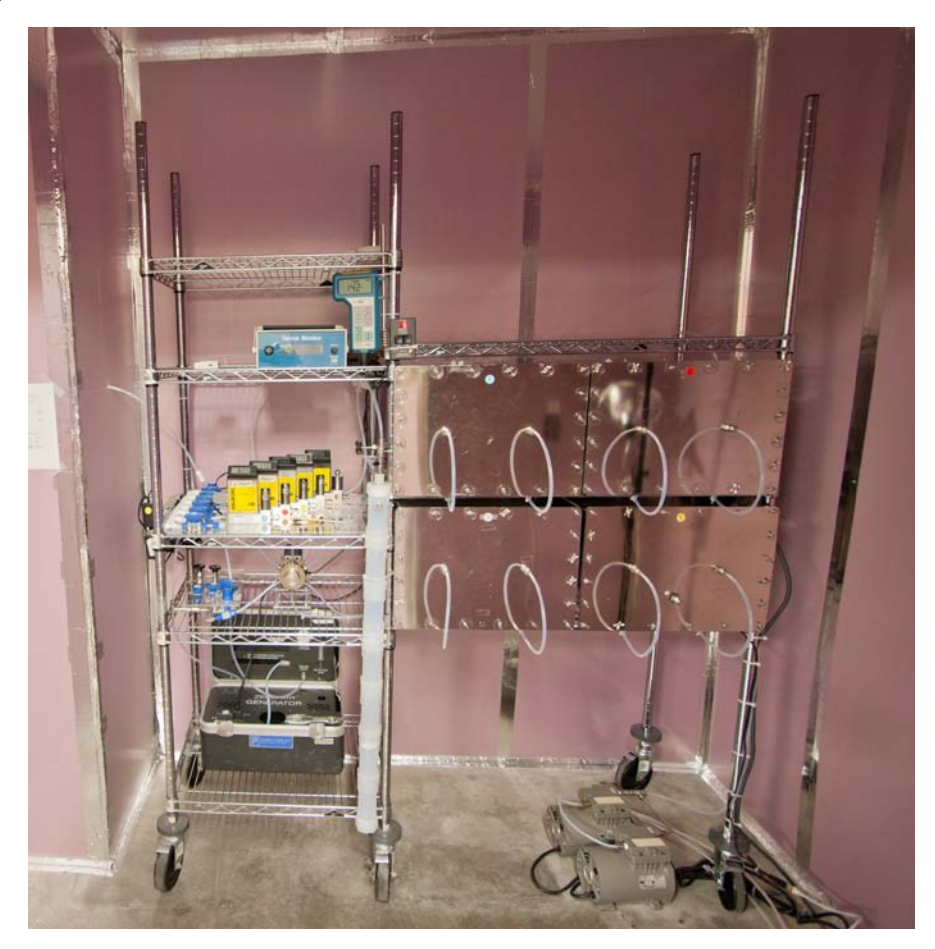
Figure 1. Experimental system for the ozone deposition experiments.

P1-1.2. Modification and performance testing of experimental system. Construction of the experimental system, shown in Figure 1, was completed on November 31, 2010. Preliminary testing, including quality assurance tests and corrective actions, was completed on January 17, 2011.